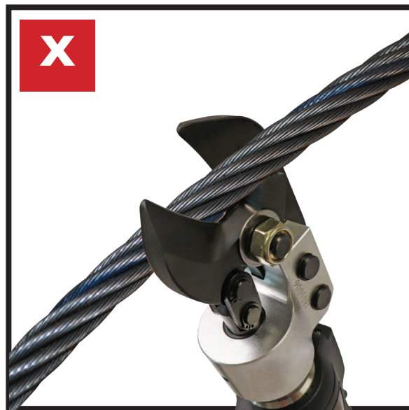
Figure 8B. Incorrect material placement.